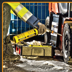
DEVELOPED FOR WINTER CONDITIONS