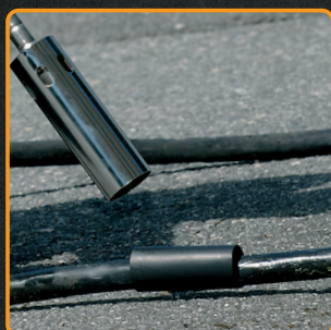
SHRINKING (with optional burner)