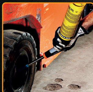
MADE FOR 360° USE

Regulate gas flow. Control the amount of gas flowing through the burner depending on the application, safe and economical.