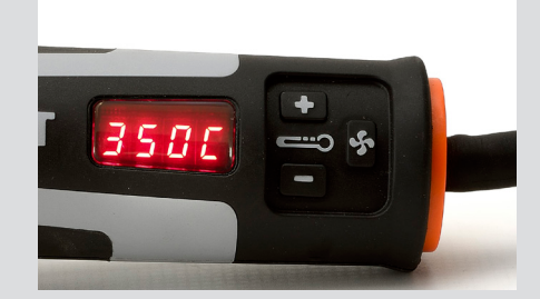
Revolutionary temperature precision

Built in temperature sensor for accurate temperatures