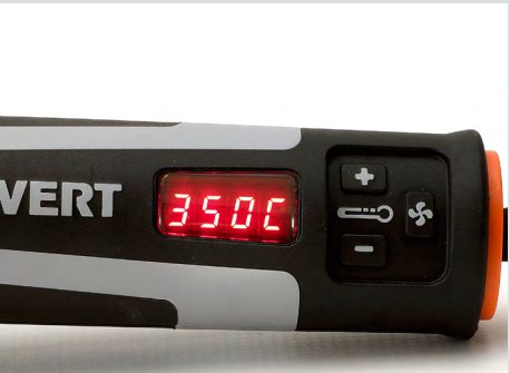
Revolutionary temperature precision