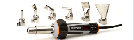
Complete range of nozzles