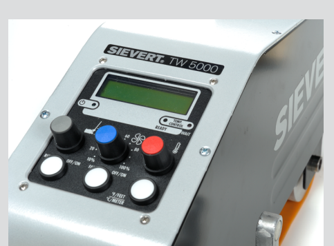
Easy to operate interface