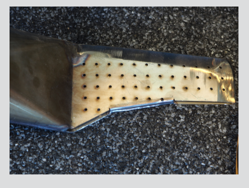
130 mm specially developed nozzle