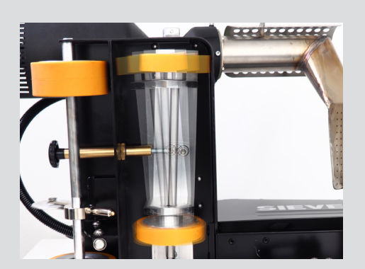
Adjustable tracking wheels